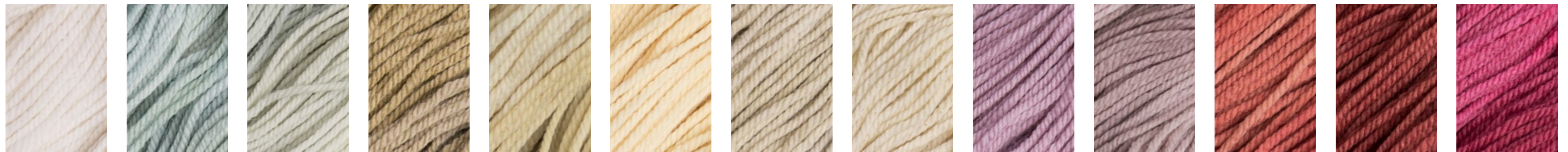
NATURAL MARIGOLD + INDIGO A MARIGOLD + INDIGO B MARIGOLD 4 MARIGOLD 1A MARIGOLD 1B MARIGOLD 3 MARIGOLD 2 COCHINEAL 2A COCHINEAL 2B MADDER A MADDER B COCHINEAL 1A

Worsted-spun 3-ply | 220 yards | 100g hank